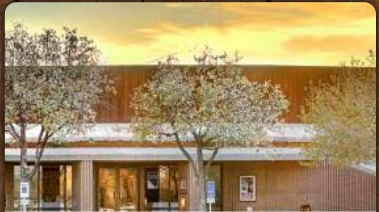
Fallon Convention Center